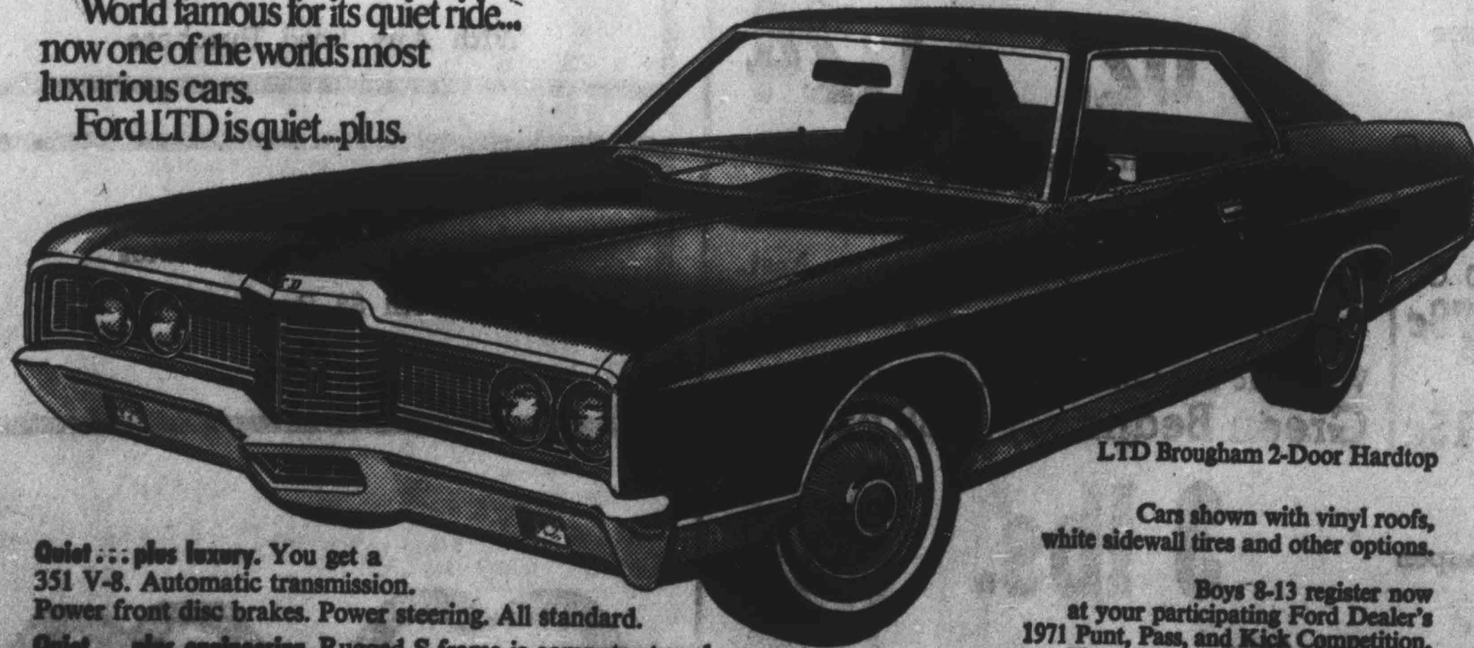
LTD Brougham 2-Door Hardtop

Ford LTD. World famous for its quiet ride... now one of the world's most luxurious cars. Ford LTD is quiet... plus.