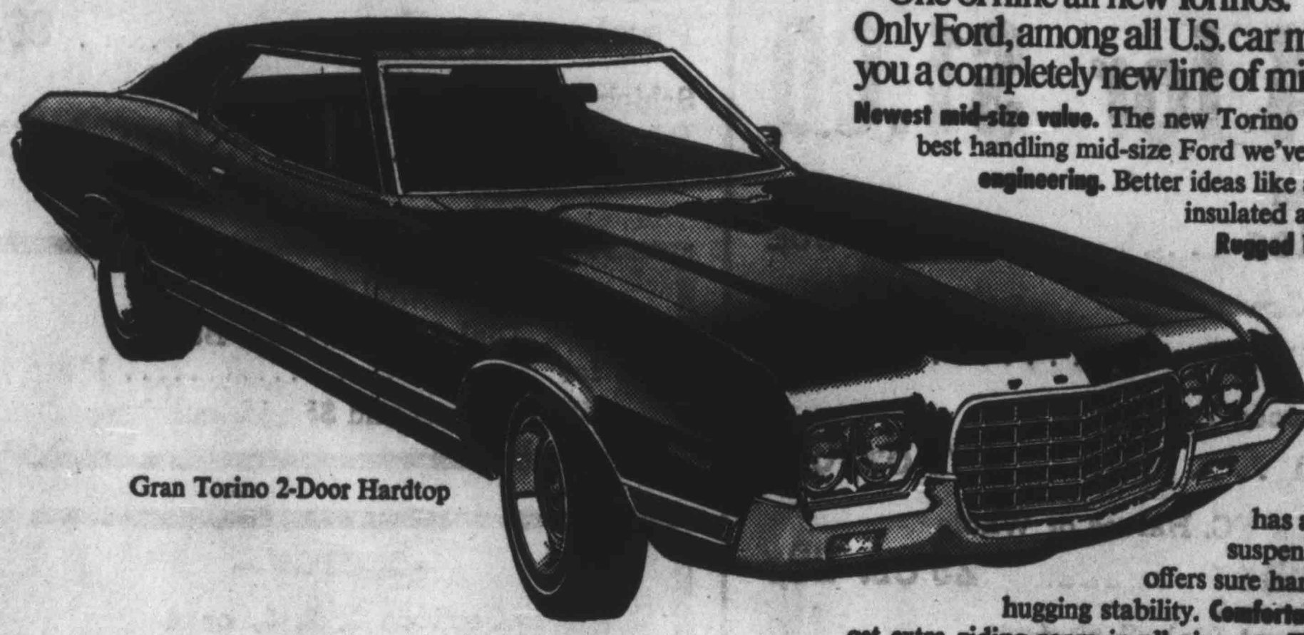
Gran Torino 2-Door Hardtop

New 1972 engineering, styling, at frozen 1971 prices... Never a better time to buy a Ford!